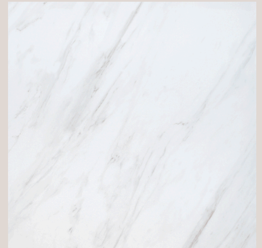
UPGRADED 24X24 FLOOR TILE