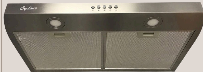
UPGRADED HOOD FAN