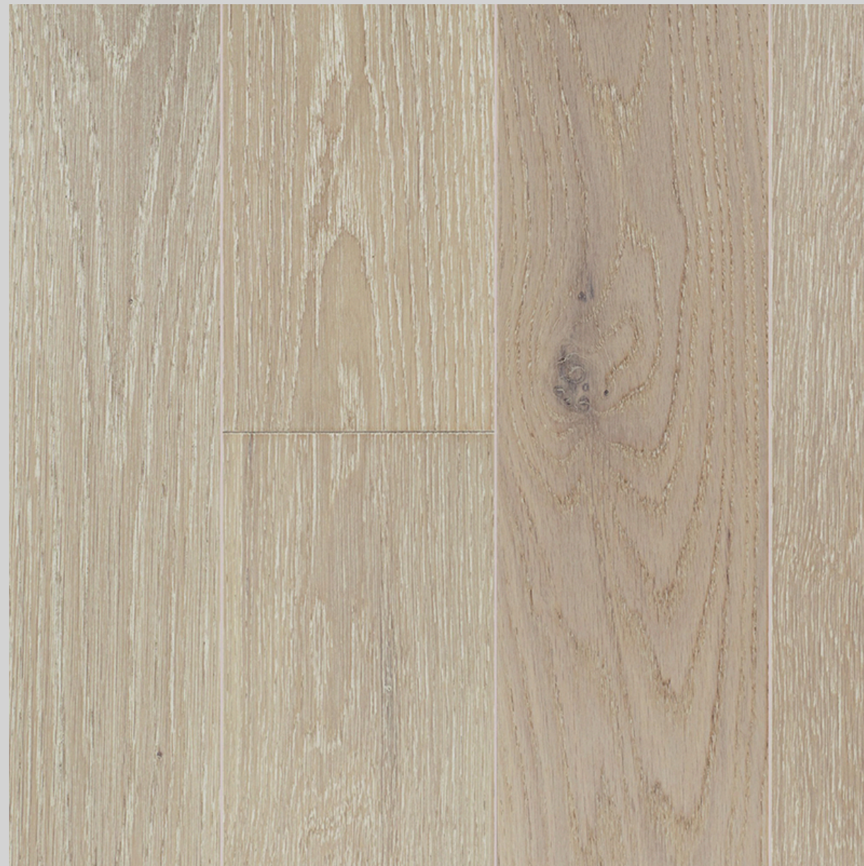
HARDWOOD FLOOR - HALL | PRINCIPAL BEDROOM