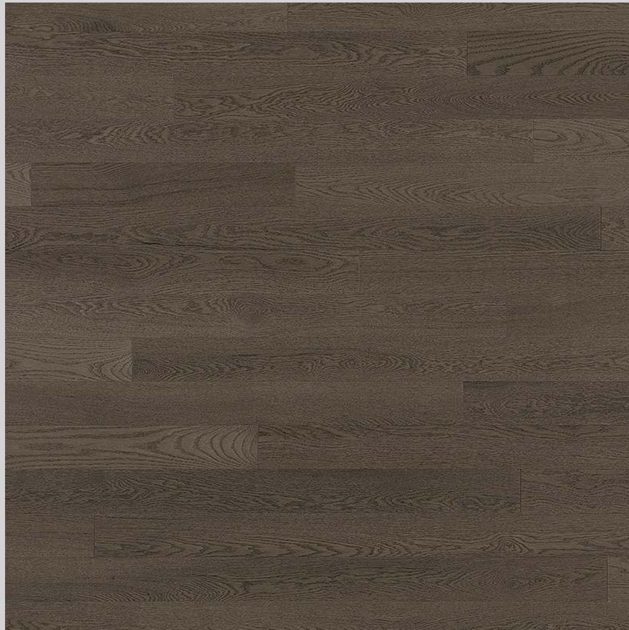
HARDWOOD - HALLWAY