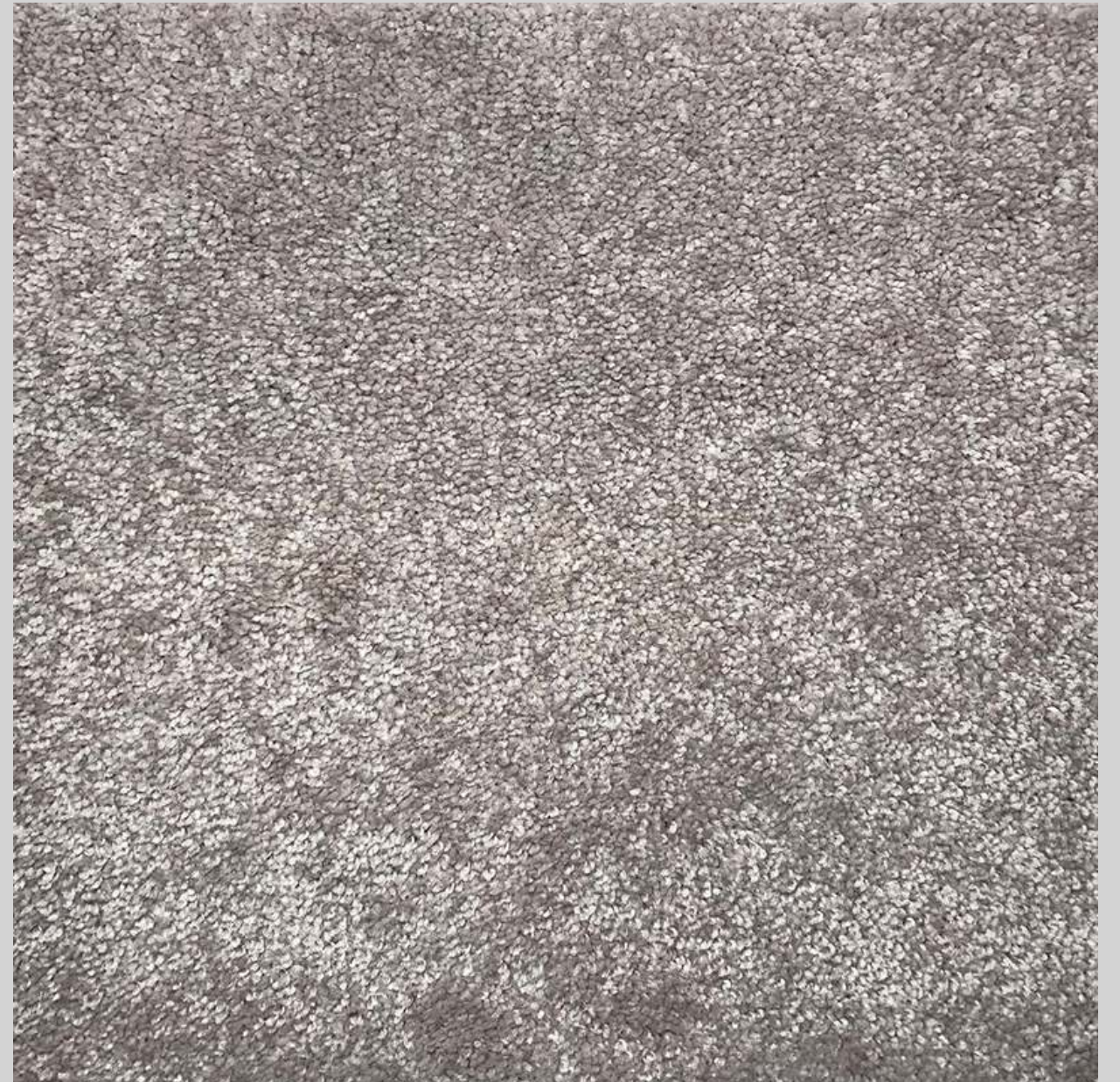
CARPET - BEDROOMS